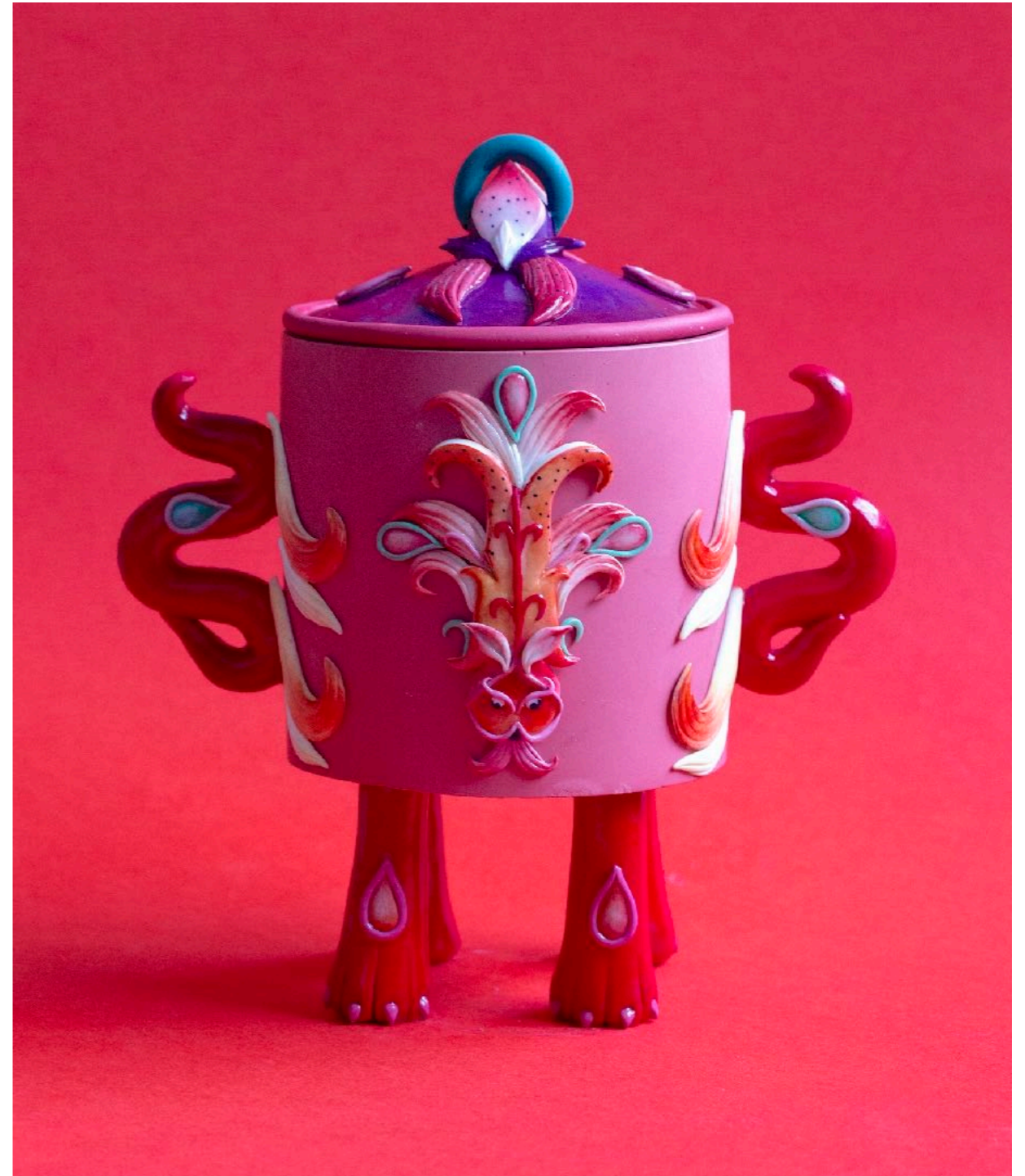
Ruby Dragon Snuff Bottle