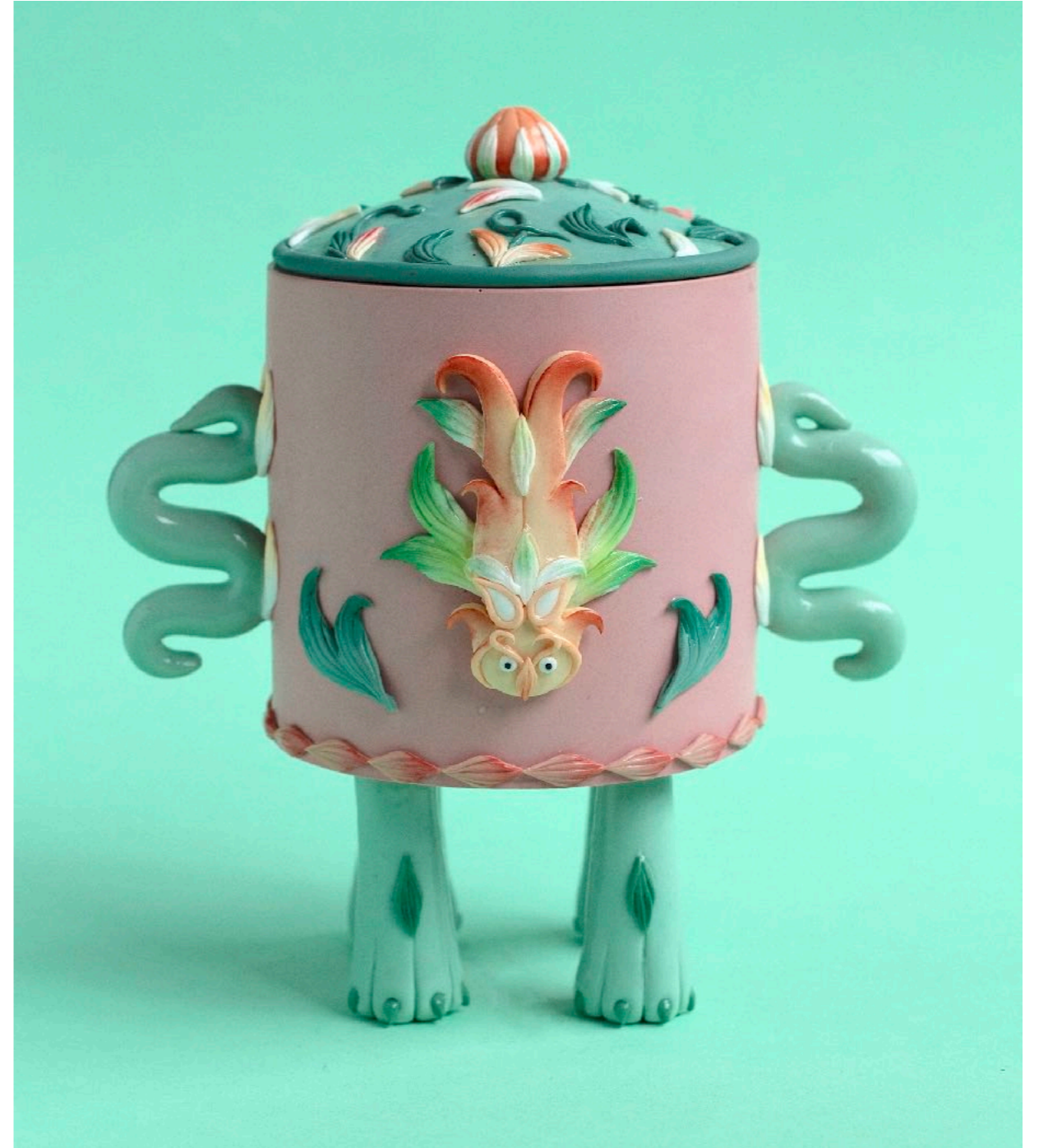
Lotus Fish Snuff Bottle