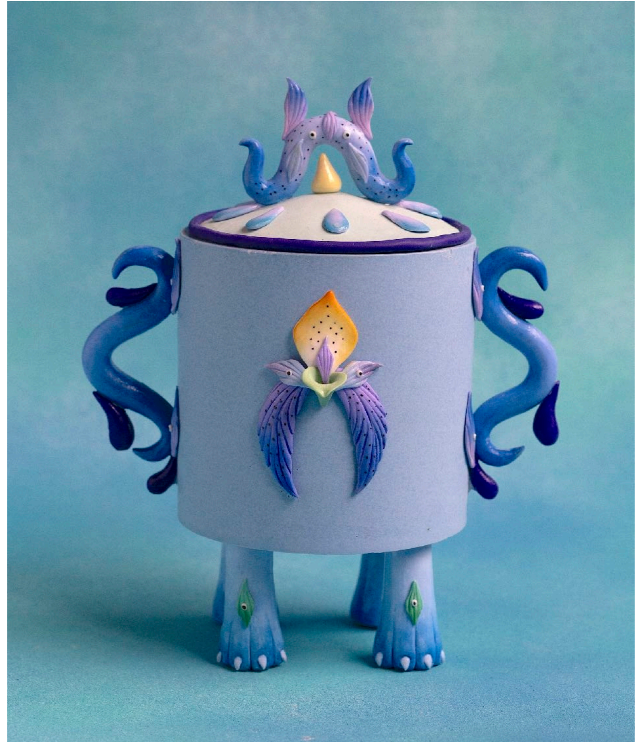
Blue Heluo-Fish Snuff Bottle