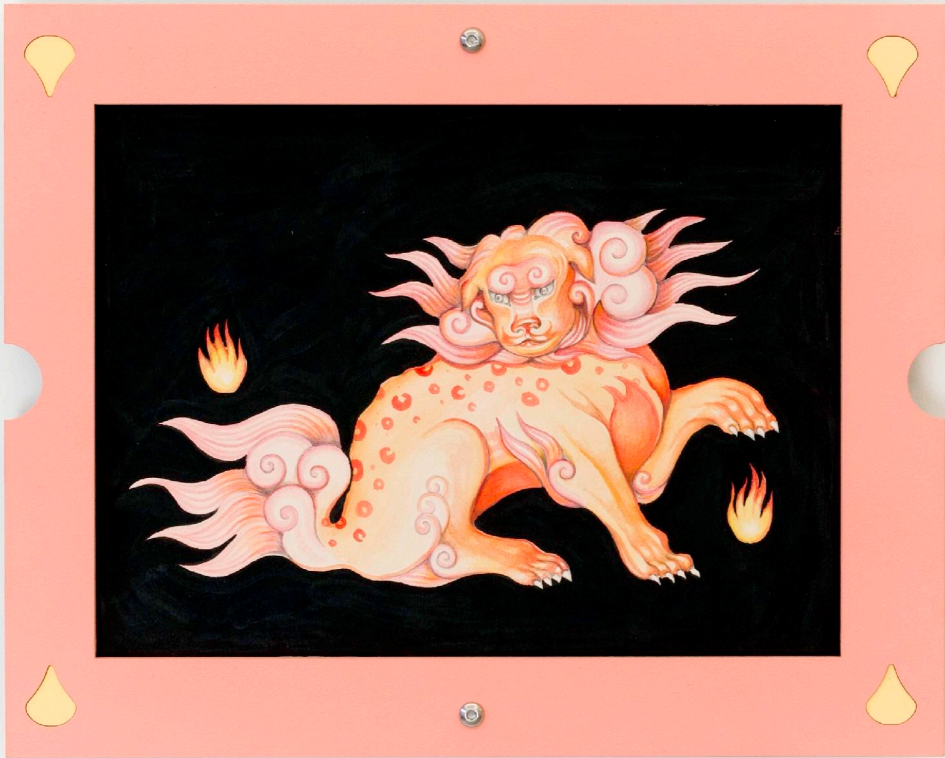
Fiery Fu Dog, 2023

Watercolour and acrylic on Fabriano paper in a handmade MDF frame, finished acrylic emulsion and clay detailing.