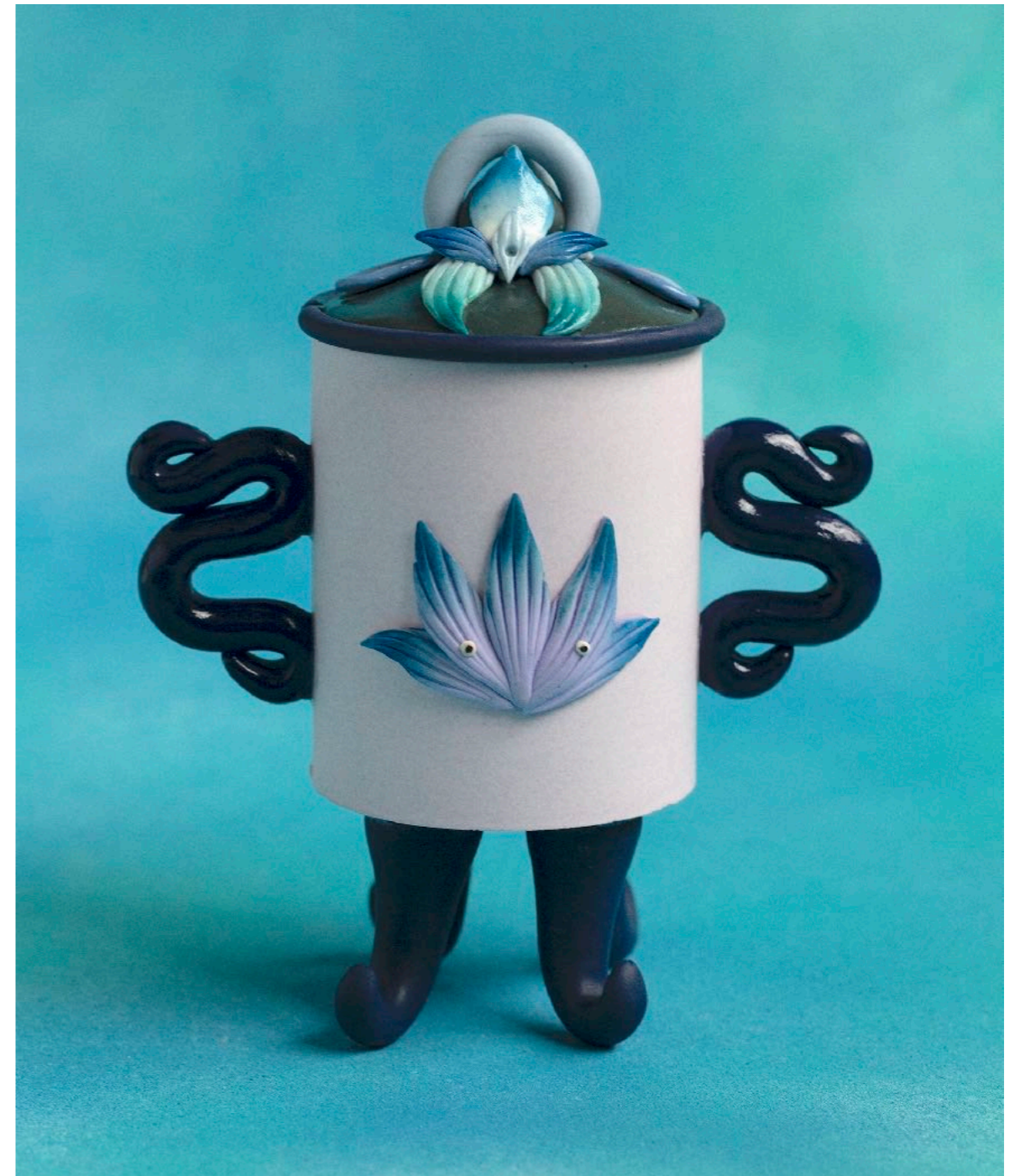
Purple Lotus Snuff Bottle