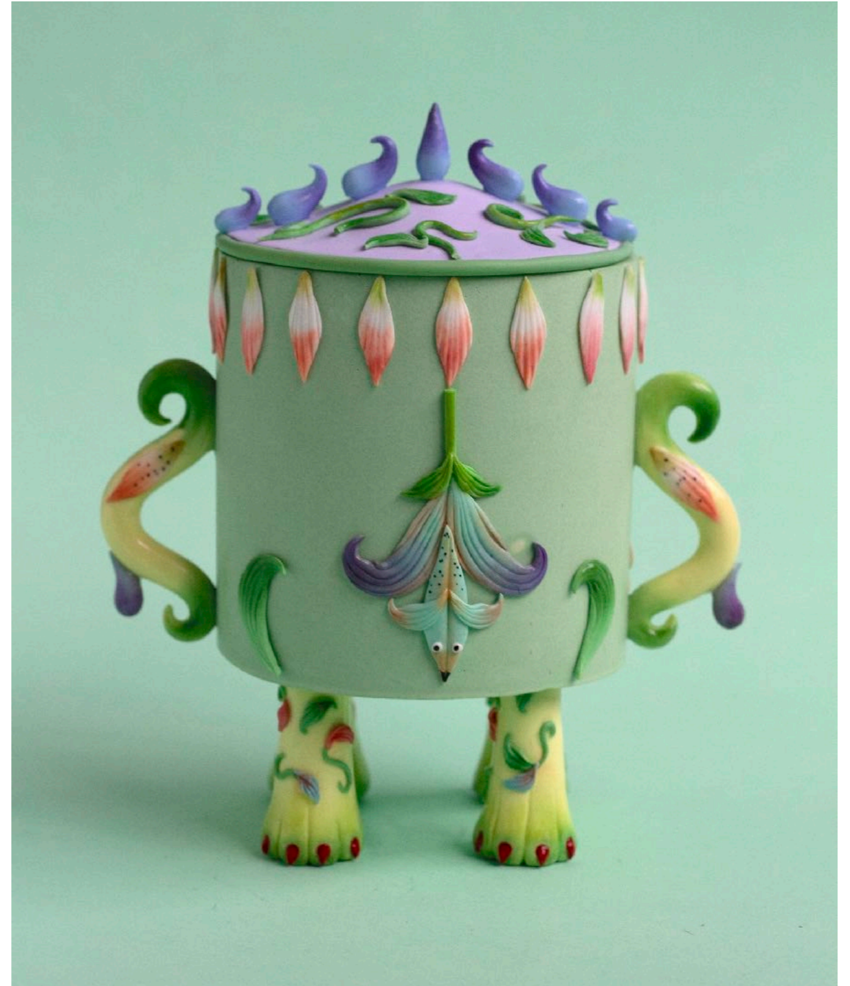
Jewelled Dewdrop Snuff Bottle