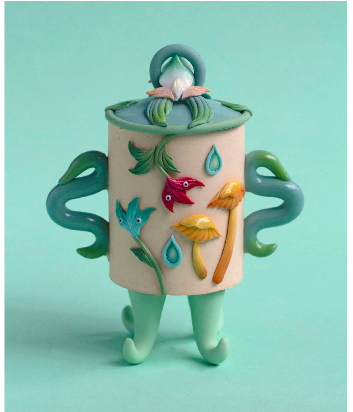
Enchanted Pond Snuff Bottle