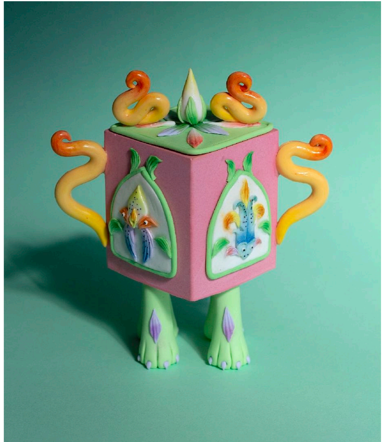
Glowing Spirit House Snuff Bottle