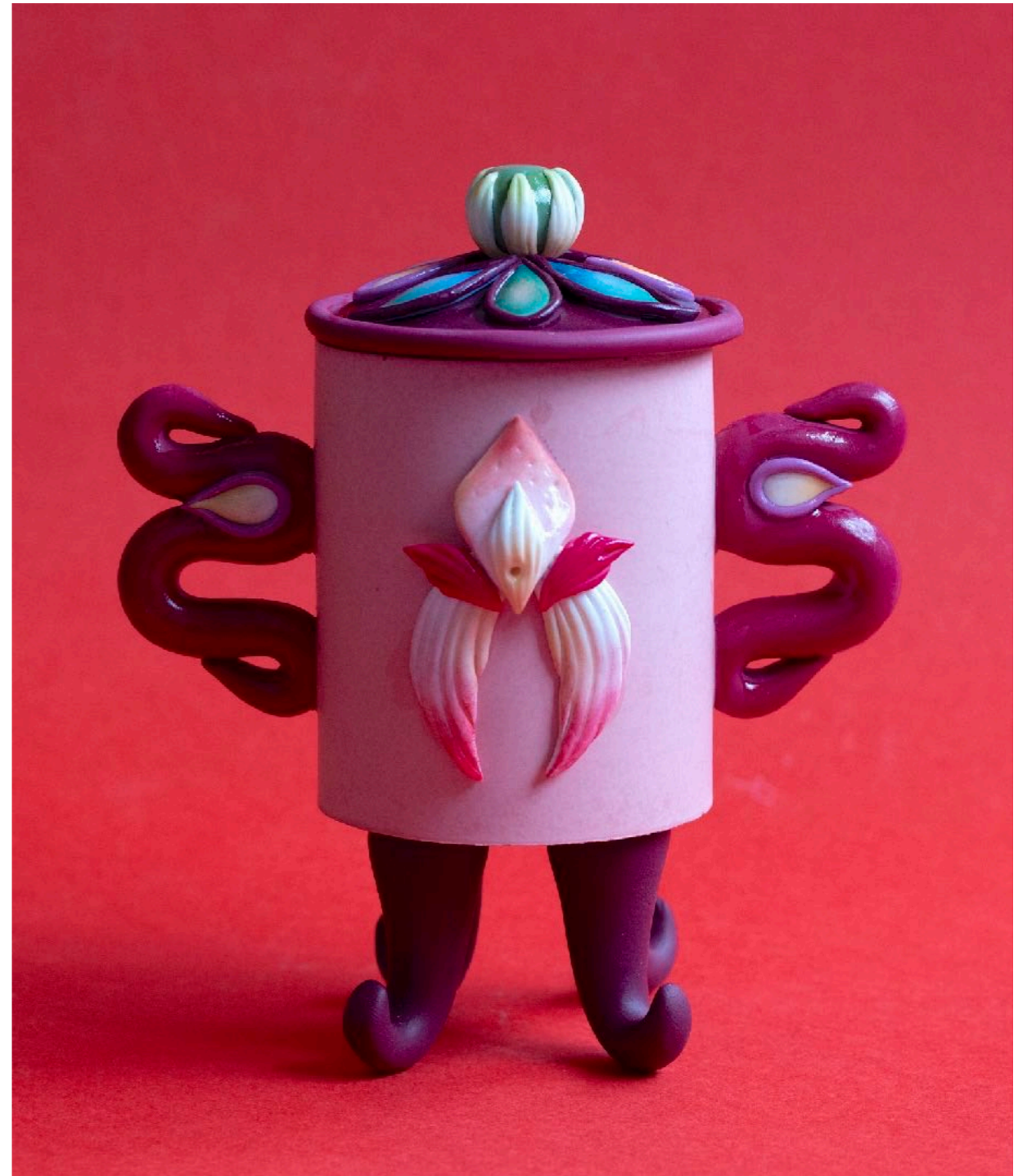
Little Flame Snuff Bottle